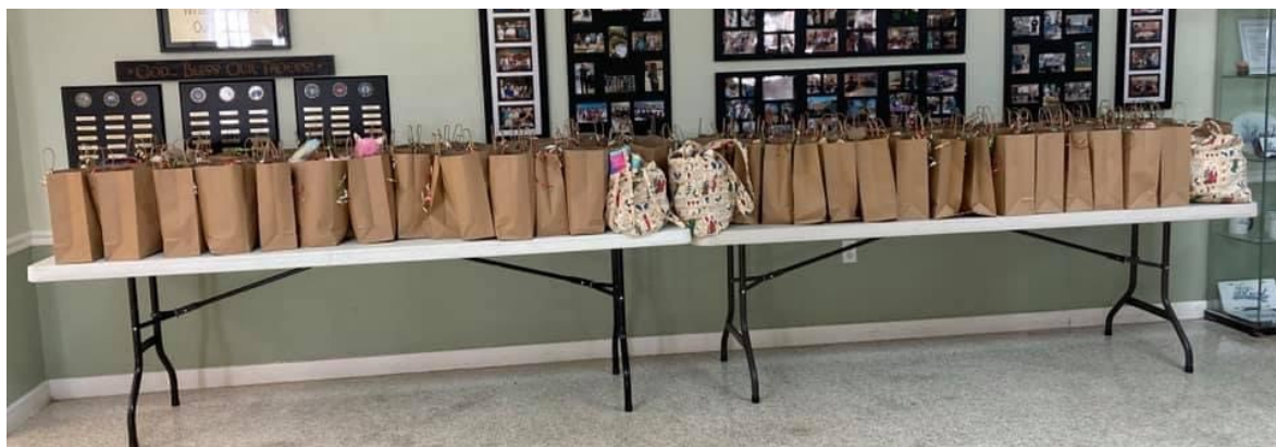
Christmas Bags for Kids