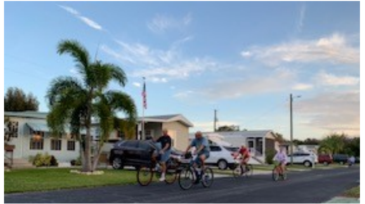
New Years Eve Bikers