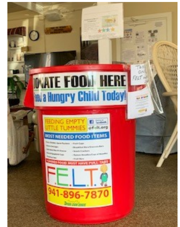
F.E.L.T. Bucket continues to fill!