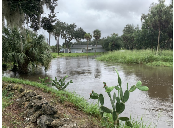
View from Parkerville after Eta