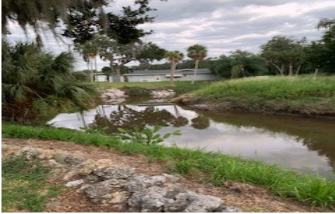
Normal view from Parkerville