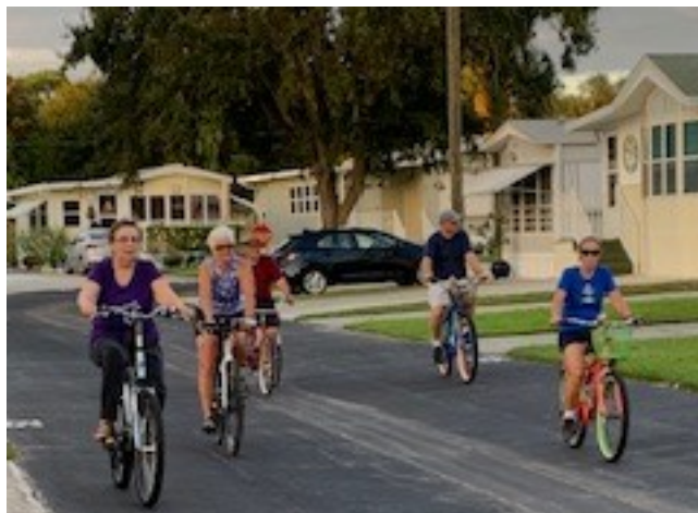
Rollin' & Strollin'