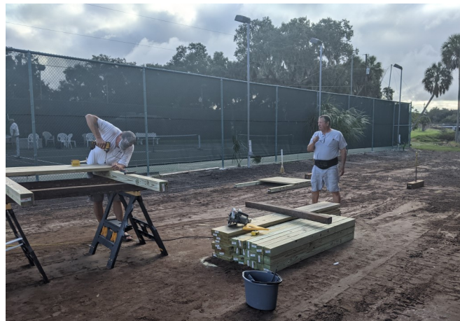
Getting ready for Horseshoes