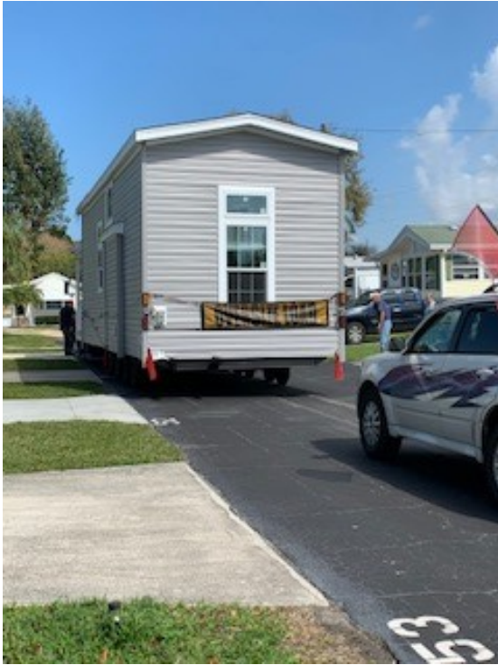
Still on the Street

The newest house .... Still on the truck