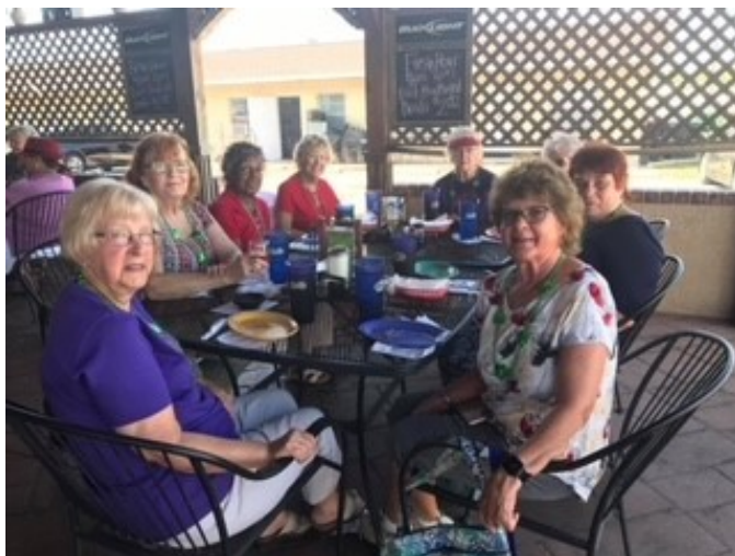
The Red Hats enjoy Alvarez Mexican Restaurant