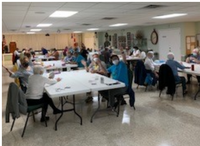
Great turnout for cards night!