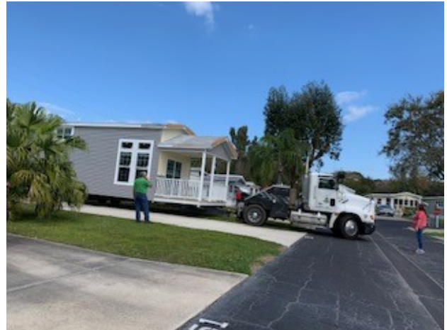
Finding just the right spot

The newest house .... Still on the truck